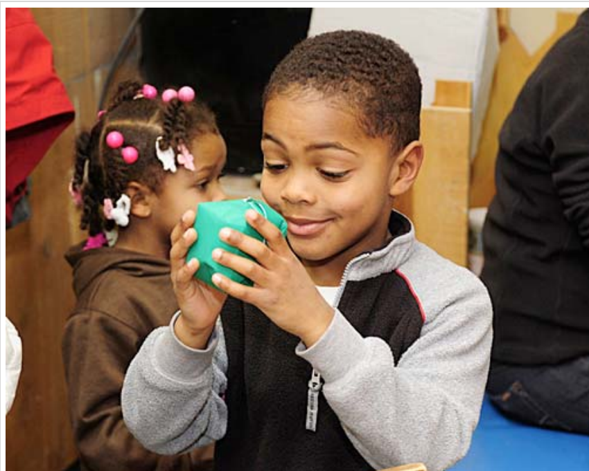
Both the young and young-at-heart can create a flurry of crafts at the MU Workspace (5-9 p.m.) during WinterFest 2011 on Dec. 2.