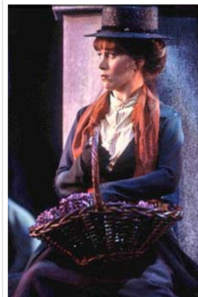
My Fair Lady will be on the Stephens stage Feb. 23, 2012.

To order tickets to multiple shows, go to the Iowa State Center ticket office in Stephens (open 10 a.m.-4 p.m. Monday-Friday), or download the order form on the center's website . It can be faxed in (515-294-6995) or mailed to: Suite 102, Scheman Building, Ames 50011-1113.