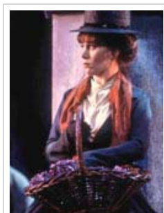
Season at Stephens

Employees who intend to apply for the Phased Plus Retirement Incentive program must submit applications to their departments by 4 p.m. Thursday, June 30.