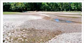
An unintended sand trap stretches across Veenker golf course.

Status: Driving range and practice facilities are open. A playable nine-hole course is expected to open by Friday, Aug. 20.