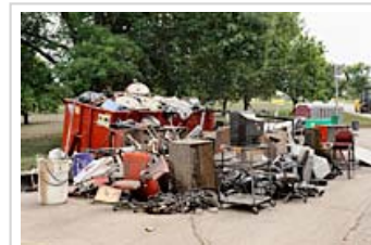
Flood-damaged items from Hilton Coliseum.

Cleanup: Water and muck have been removed. Wet sheetrock and carpeting were removed from second-floor office areas. Movable equipment and furniture in the building have been assessed for usability. Temporary lighting has been installed, and dehumidification equipment is running. Assessment of electrical systems is under way.