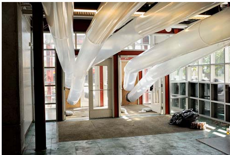
Plastic ventilation tubes bring dehumidified air in to help dry the Lied Center.