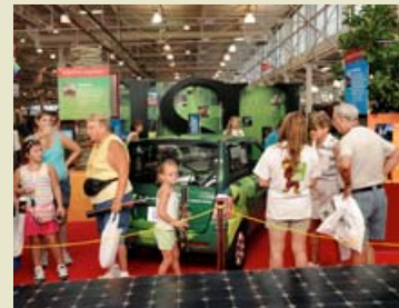
Iowa State Fair