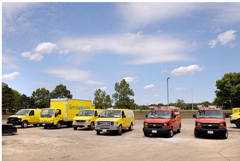
A fleet of flood-relief vehicles has been staged in the Iowa State Center parking lots.