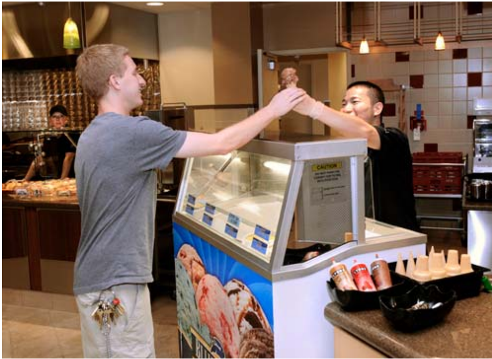
Conversations is the place to go for hand-dipped ice cream.