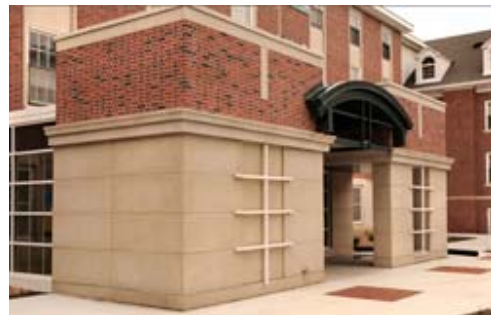
A new south foyer to Oak-Elm Hall includes an elevator that services just the dining level.