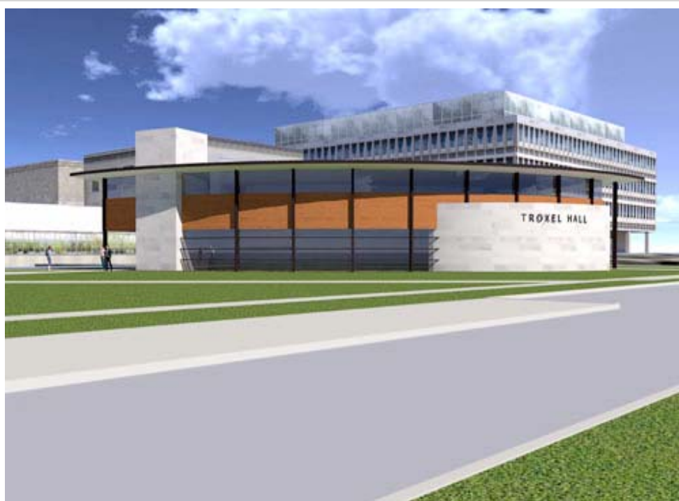
Artist's rendering of Troxel Hall, as viewed from the southeast. Bessey and Horticulture halls are visible behind it. Submitted image.