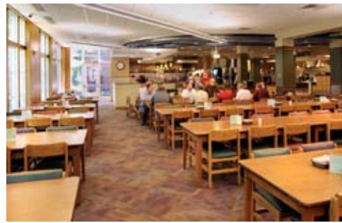
Back by popular demand: the same dining tables and chairs, in the same large configurations.