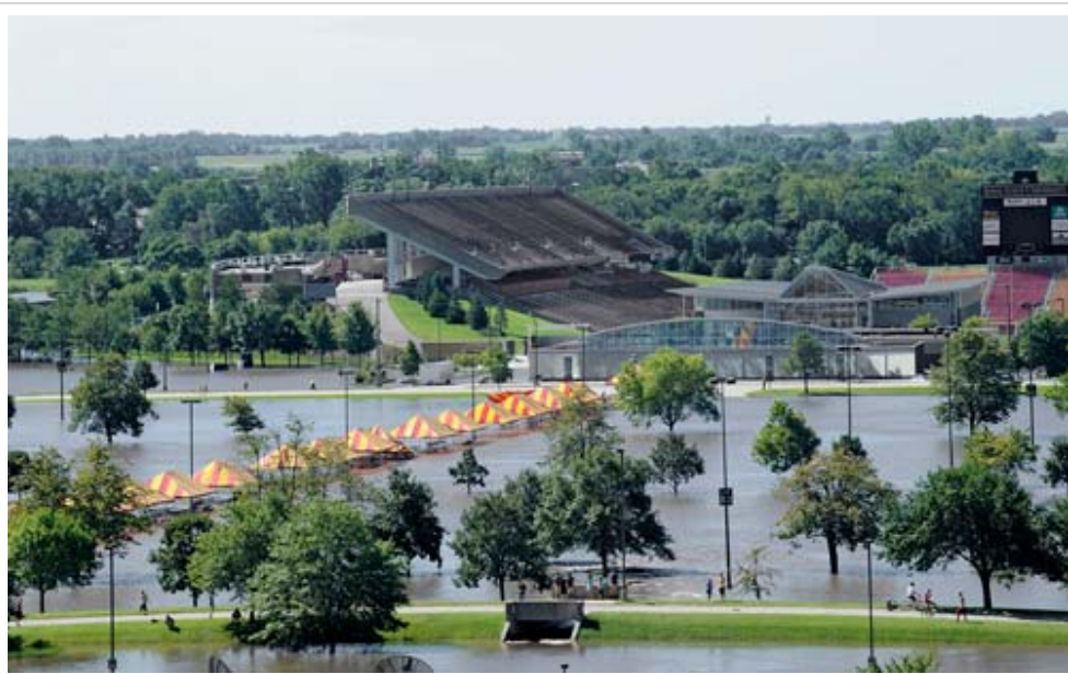
A southerly view of the flooded Iowa State Center parking lots.