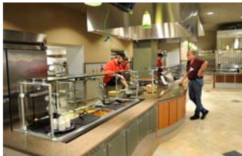
The "Creations" station will feature different made-to-order entries each meal.

The renovation was done within the existing footprint, so the size hasn't changed. At $5.2 million, this renovation is a