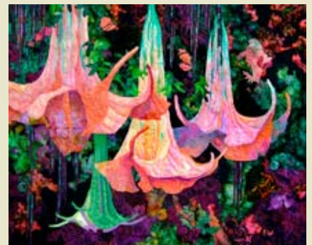
Garden Quilt Show