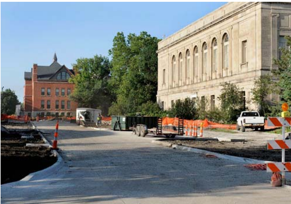
North end of the Morrill Road replacement project.

Working around and through atypical precipitation and heat this summer, crews are making progress on construction projects around campus. University photographer Bob Elbert provides these visual updates from a few locales.