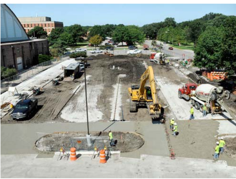
A birdseye view (from Hach Hall) of the beginnings of a reconfigured parking lot 22 north of the Armory.

Published by University Relations, inside@iastate.edu , (515) 294-7958, Ames, Iowa 50011. Copyright © 1995-2010, Iowa State University of Science and Technology. All rights reserved.