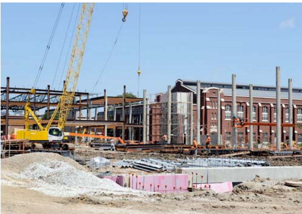
Looking northeast at the recreation services addition to State Gym.