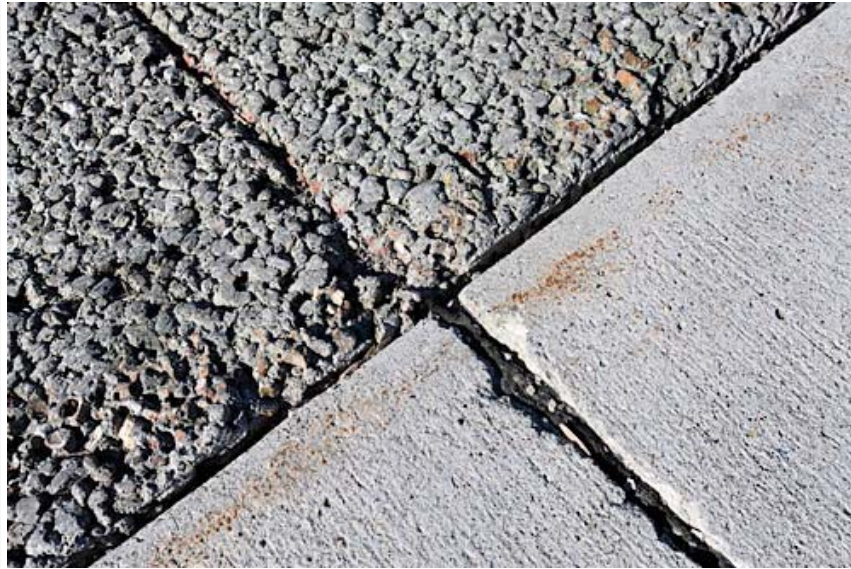
Experimental Lot 122 in north campus is half regular concrete (bottom) and half pervious concrete (top).