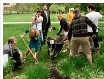
Future cherry pies

In commemoration of Earth Day, Arbor Day and Veishea cherry pie makers, three cherry trees were planted outside MacKay Hall last week.