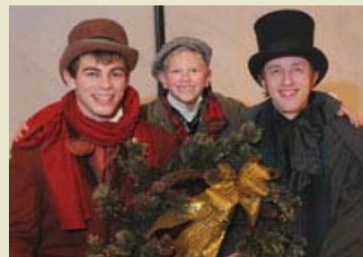
A Christmas Carol