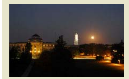
Haunted Iowa State