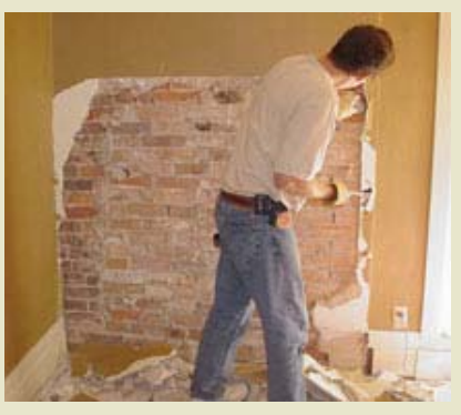
'Object Lessons' lecture series