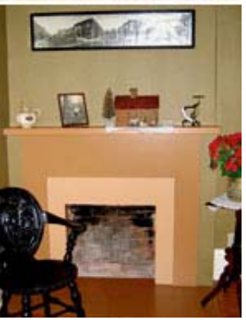
Before and after photos of a fireplace restoration in the Farm House. Maintaining the National Historic Landmark is the next subject in the Object Lesson series, Oct. 6. Submitted photos.

The planned lectures to close out the year include: