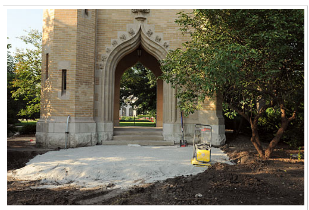
With the removal of overgrown shrubs, the Memorial Union is visible from the north side of the campanile.