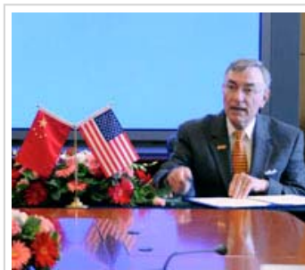
ISU delegation visits China