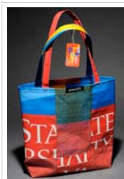
Banner tote bags