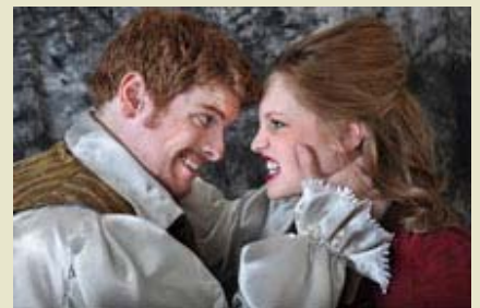
Kiss Me, Kate