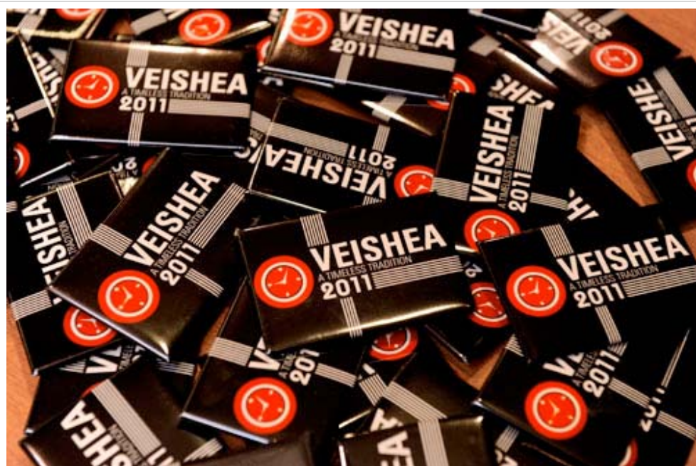
Veishea BBQ buttons are available for $5 at the University Book Store and through AccessPlus.