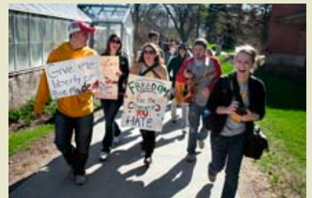
First Amendment Day