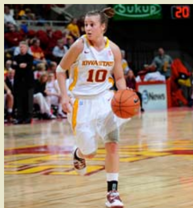
Cyclone sports weekend