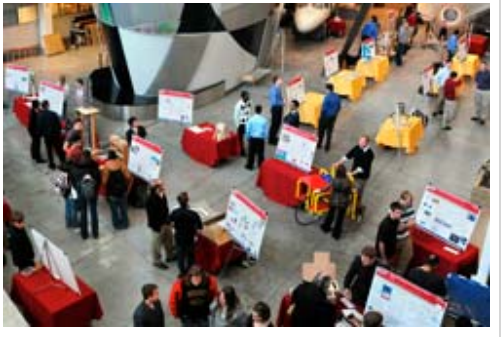
Mechanical engineering design expo

Fifty-six teams from four design courses in mechanical engineering this fall demonstrated their prototypes and answered questions from visitors during the mechanical engineering department's first Design Expo Dec. 7 in Howe Hall. The expo gives students a place to show off their work and practice talking about their designs -- an important skill for the workplace -- say the faculty members who organized the event, assistant professors of mechanical