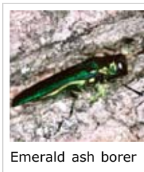
Emerald ash borer