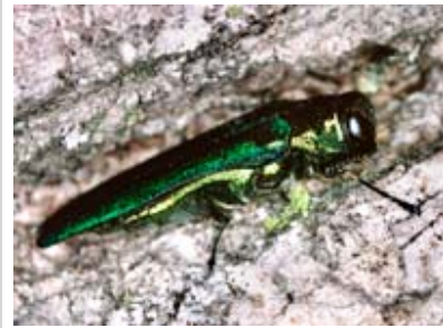
Adult emerald ash borer.

Early steps in the EAB readiness plan already were implemented. Ash trees have not been planted on campus since 2005, and FPM has not required construction and utility crews to protect ash trees near their projects. As budgets allow, ash trees will be removed in other