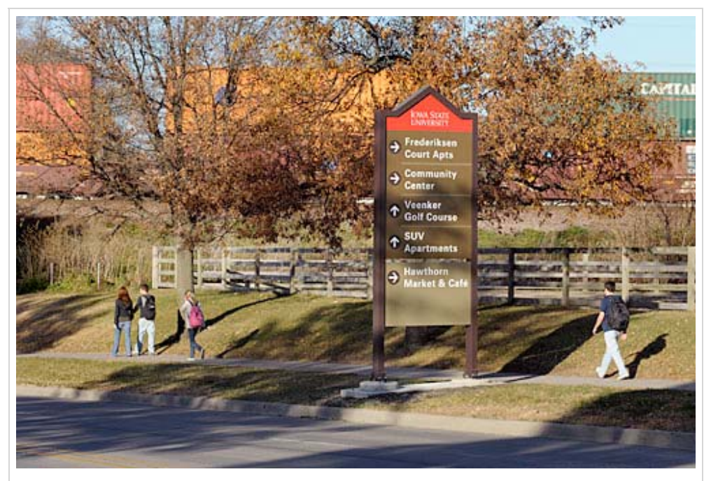
This sign along Stange Road is among 25 new directional signs intended to help drivers find their way to key visitor destinations on campus.