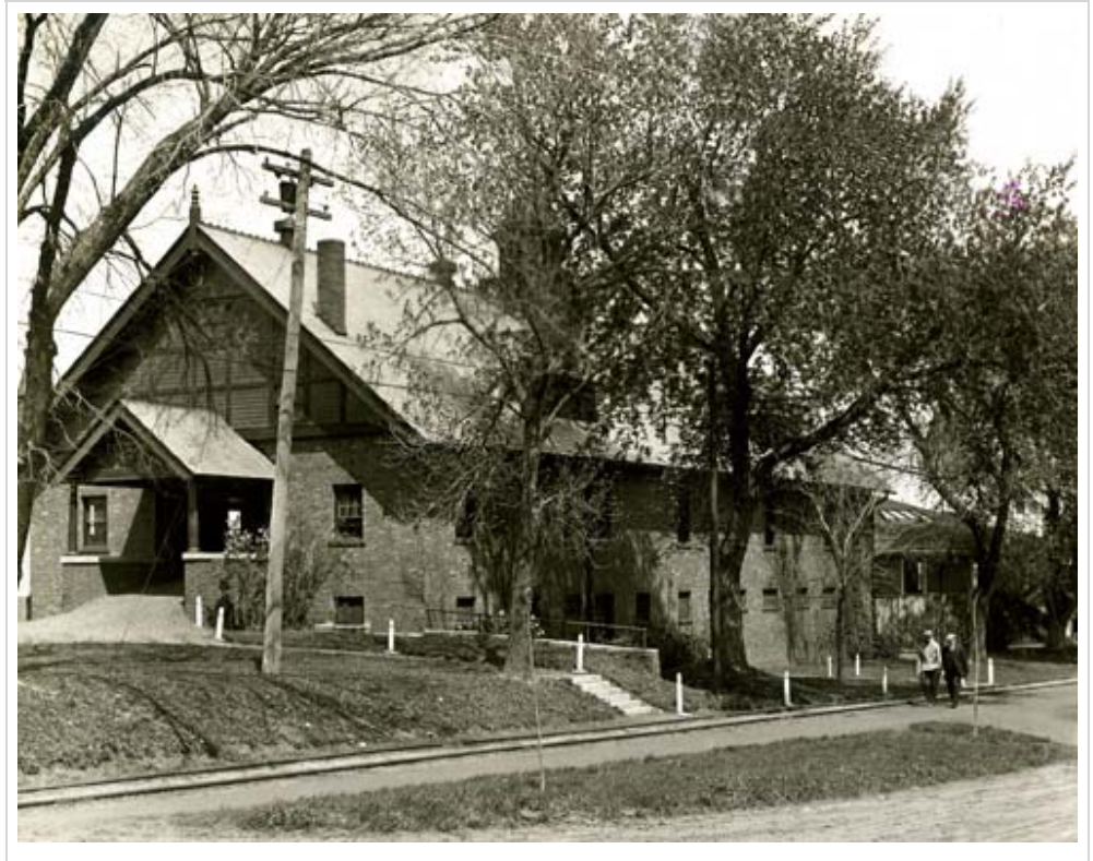
Landscape Architecture Building, circa 1913. The sycamores, as small saplings, can be seen in the foreground.