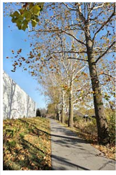
A stretch of Sycamore Row as it looks today, just south of the CyRide facilities.

Staff in facilities planning and management, which is responsible for the care of campus trees, are aware of Sycamore Row and its historical significance. Shrinking budgets play a key role in shaping their work plans from year to year.