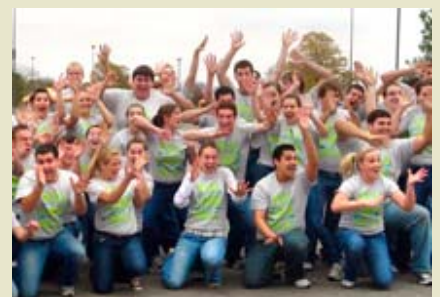
Yell Like Hell practice