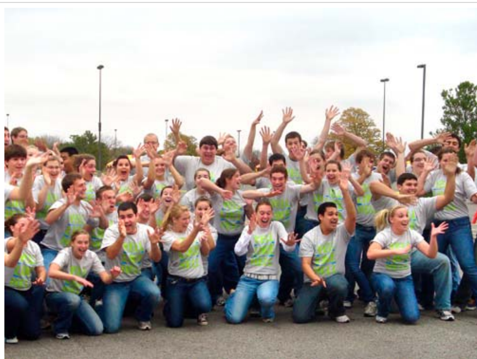
Yell Like Hell practice.