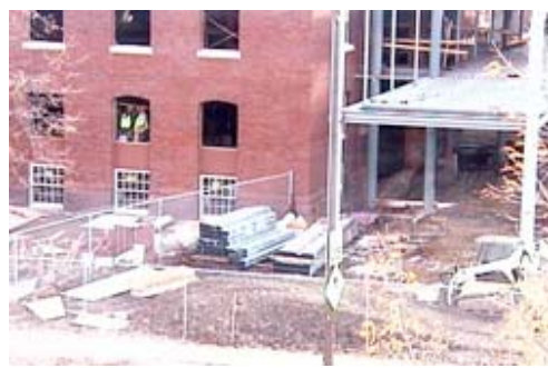
State Gym renovation view from the north.

Construction managers rely on them. Donors to building projects appreciate them. But perhaps nobody loves and uses a construction webcam like the future tenants of the building going up.