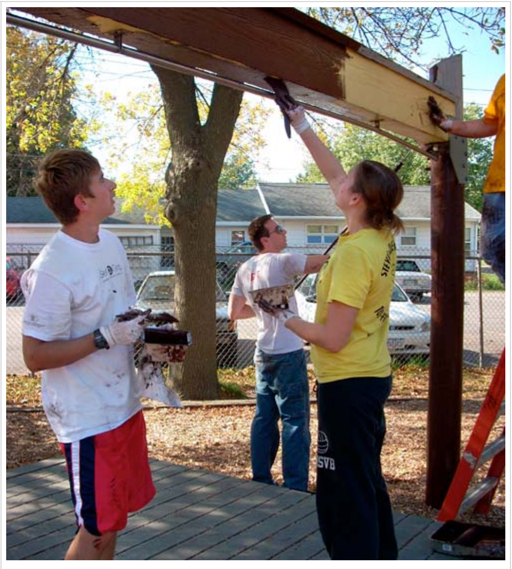
ISU students stained the playground structure at Roosevelt Elementary School during the first CyServe in 2008. Submitted photo .