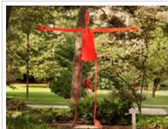
Anderson Sculpture Garden