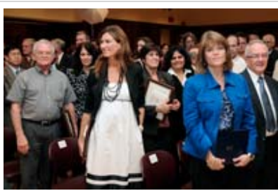
Convocation award winners