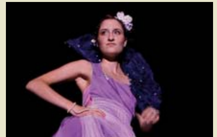
ISU Project Runway