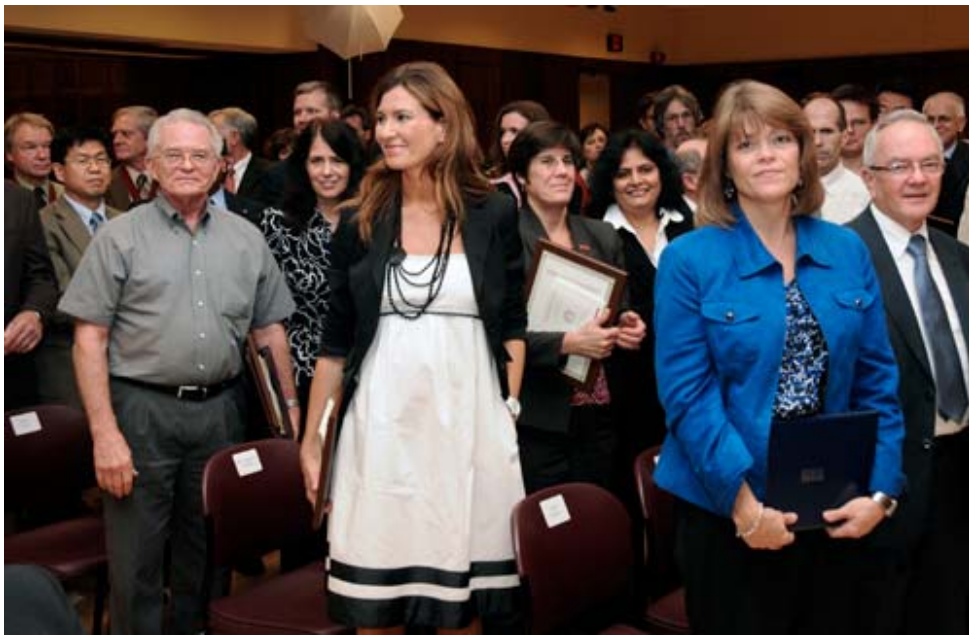
More than 60 faculty and staff were honored during the Sept. 20 convocation and awards ceremony.