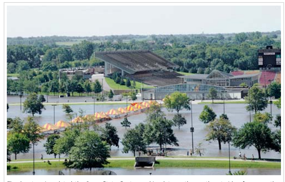
Flood waters inundated the Iowa State Center parking lots on the southeast side of campus the morning of Aug. 11.

Early summer filled Cyclone fans with uncertainty and anxiety as the Big 12 Conference appeared to be on the brink of collapse due to defections by some members. After nearly a month of discussion, only Colorado and Nebraska left the Big 12 for the Pac-10 and Big Ten conferences, respectively. The remaining 10 schools, including Iowa State, pledged their commitment to stay in the Big 12.