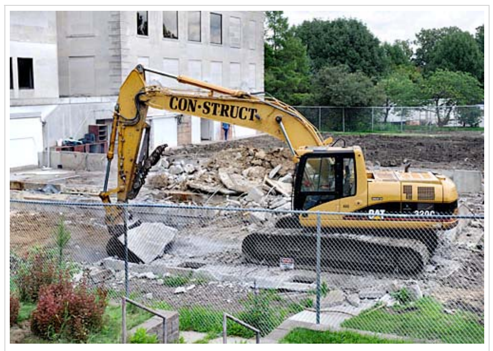
Crews spent much of the summer disassembling the old horticulture greenhouses so the components could be recycled or reused.