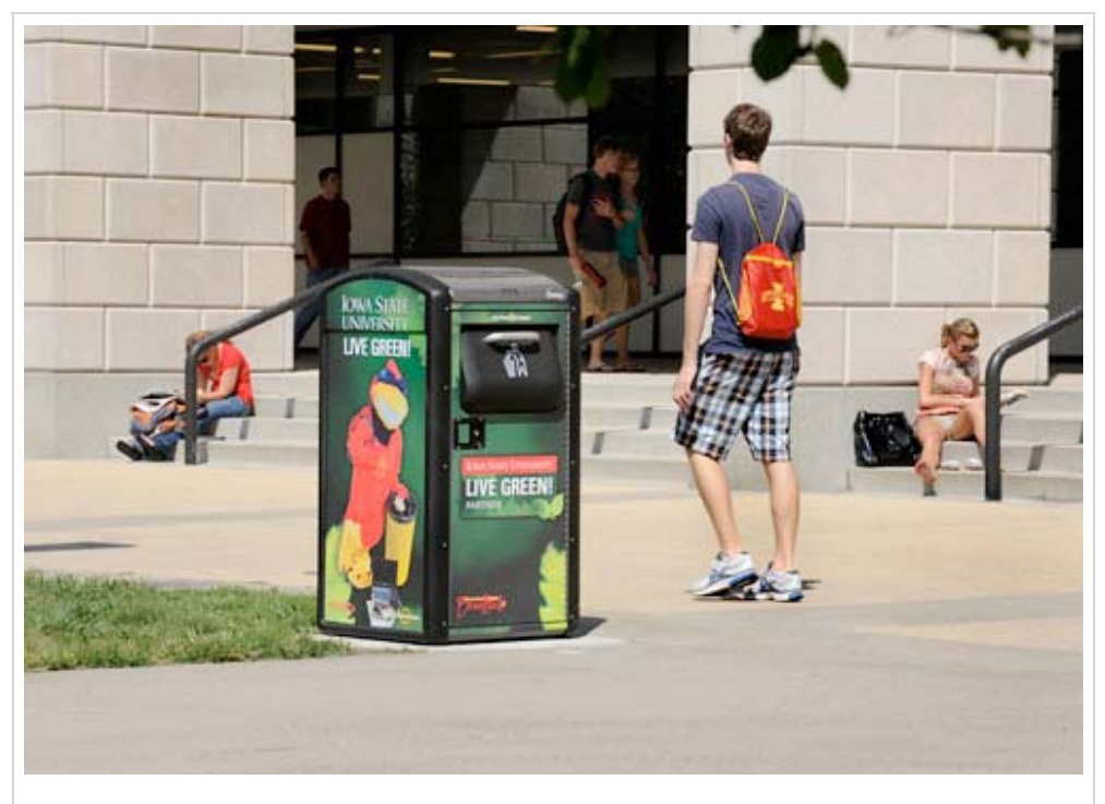
No, it's not a book drop.

Twelve new BigBelly solar trash compactors were permanently installed around campus this week. This one, south of Parks Library, is wrapped with scenes of studying and commencement. Each compactor displays a different theme, depending on where it's located.