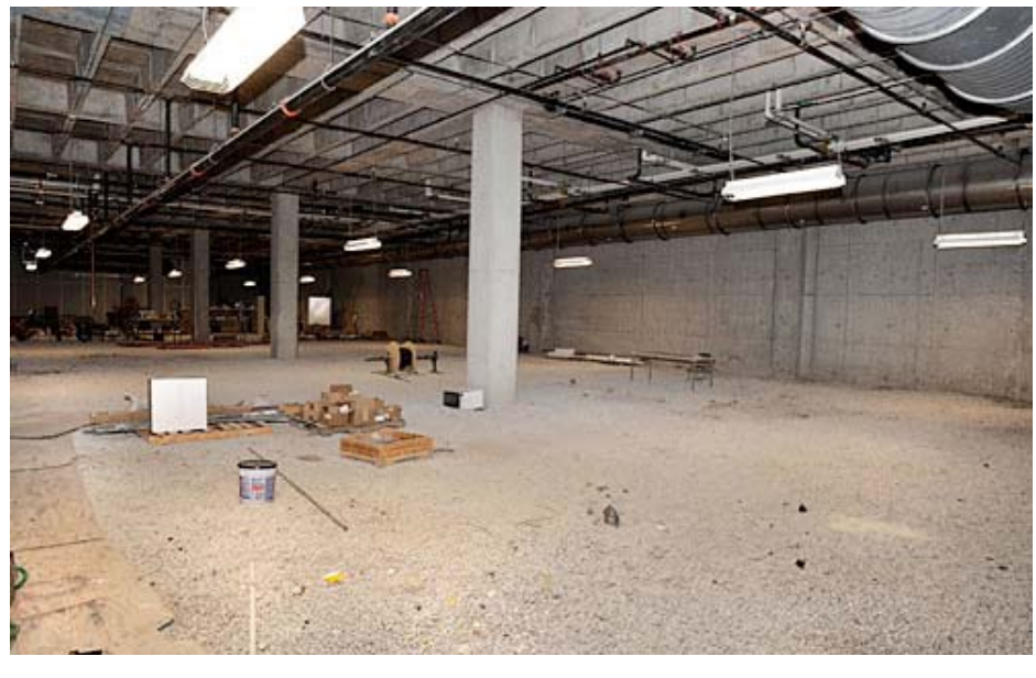
An unfinished half of the Hach Hall basement awaits the specifications of future faculty members.