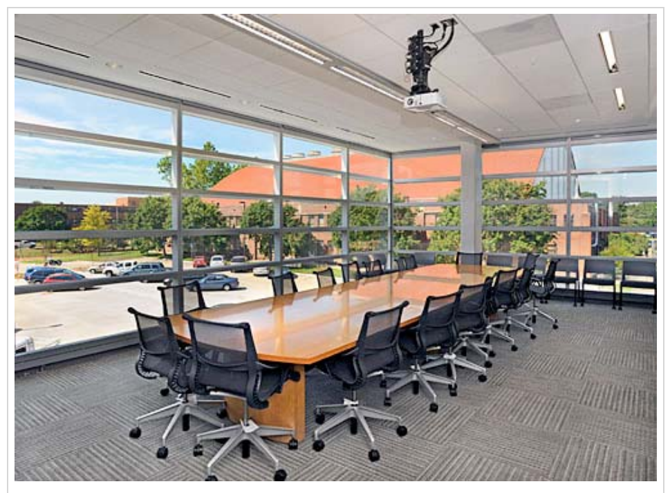
Conference room on the second floor of Hach Hall.