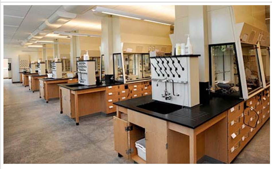
An organic chemistry teaching laboratory on Hach Hall's first floor.