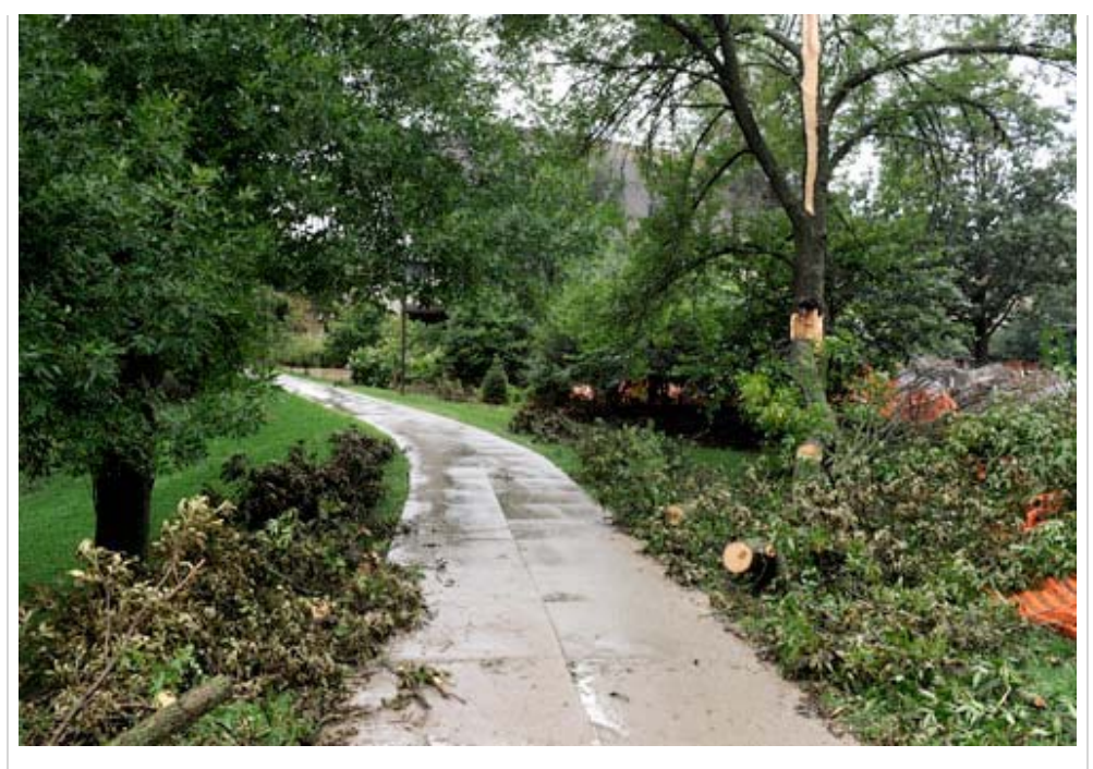
Sidewalk between Carver and Music halls.