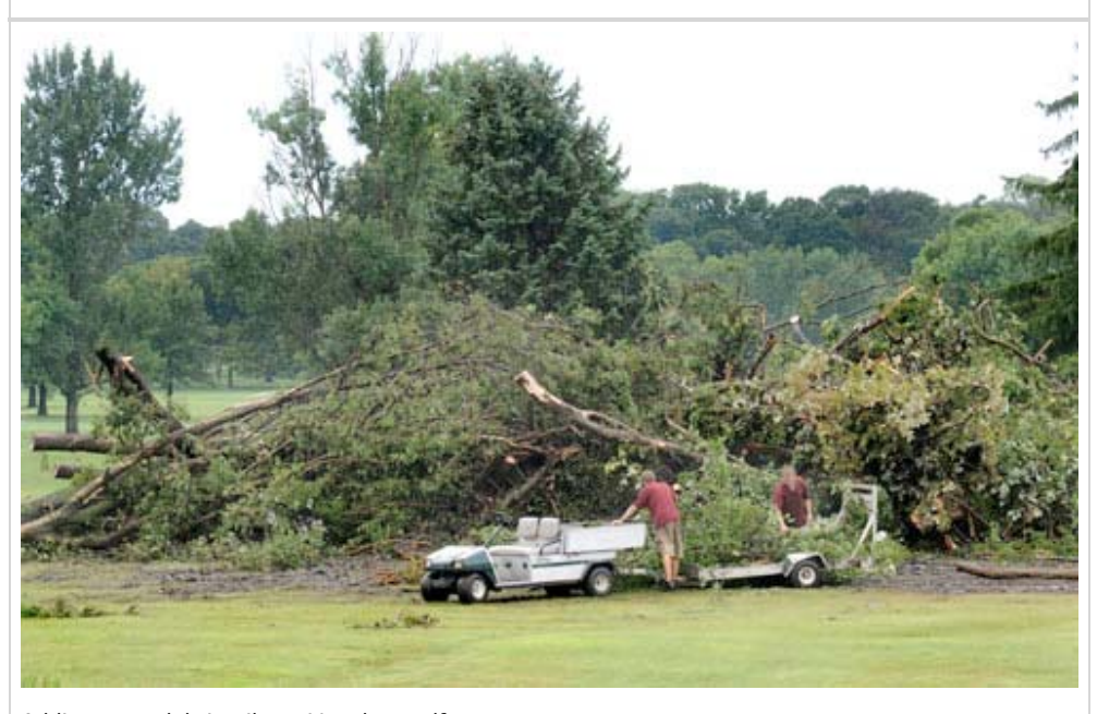
Adding to a debris pile at Veenker golf course.