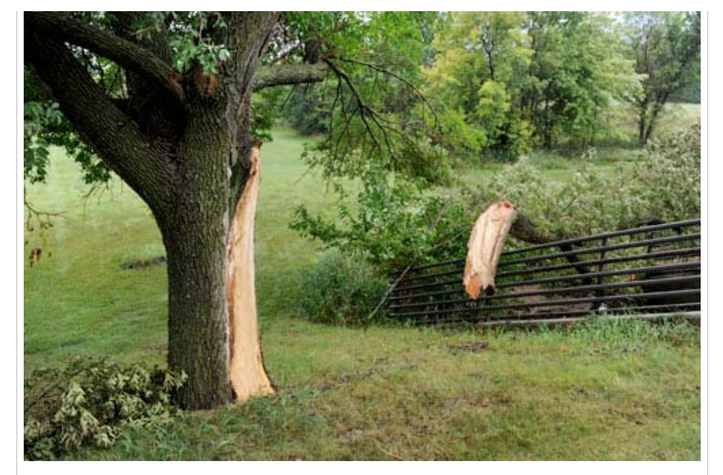
Pasture east of Stange Road and north of 13th Street.