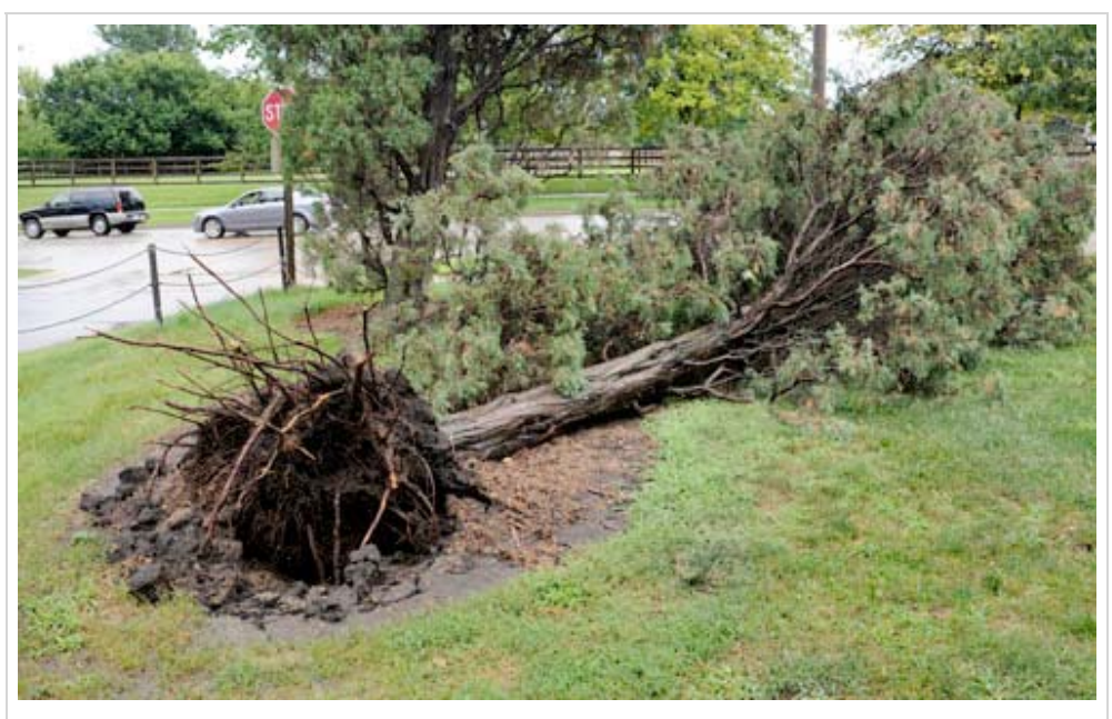
Northeast corner of Industrial Education, along Stange Road.