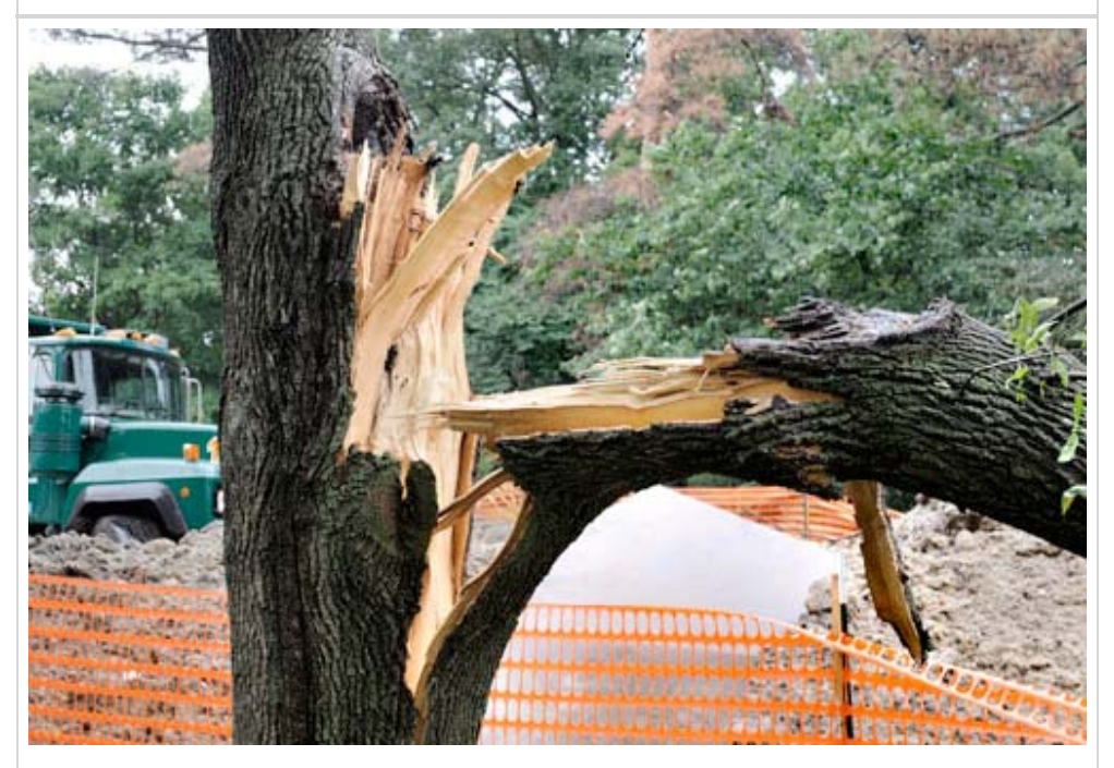
Along Morrill Road construction zone, near Carver Hall.