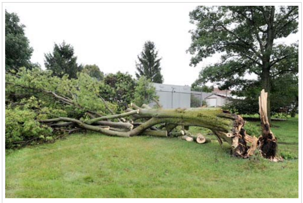
This tree northeast of the Insectary was blown over in high winds early Sunday morning. More storm damage images.