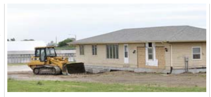
Atop a new basement, the house awaits renovations.