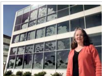
Vet Med mural by Michaela Mahady

The final documents that will make an intermodal transportation facility a reality have been submitted. The collaborative project between ISU and the city of Ames will provide a hub for bus, bike, carpool, commuter, taxi and pedestrian traffic.