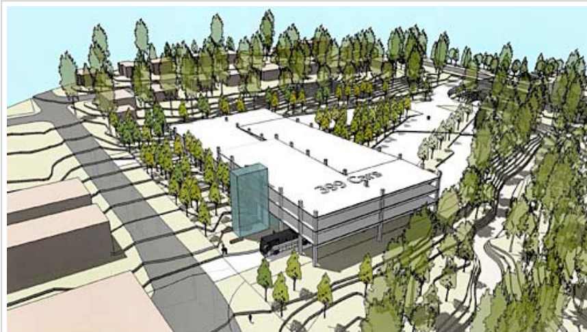
Facility concept rendering. Contributed image.