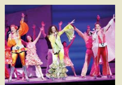
Season at Stephens