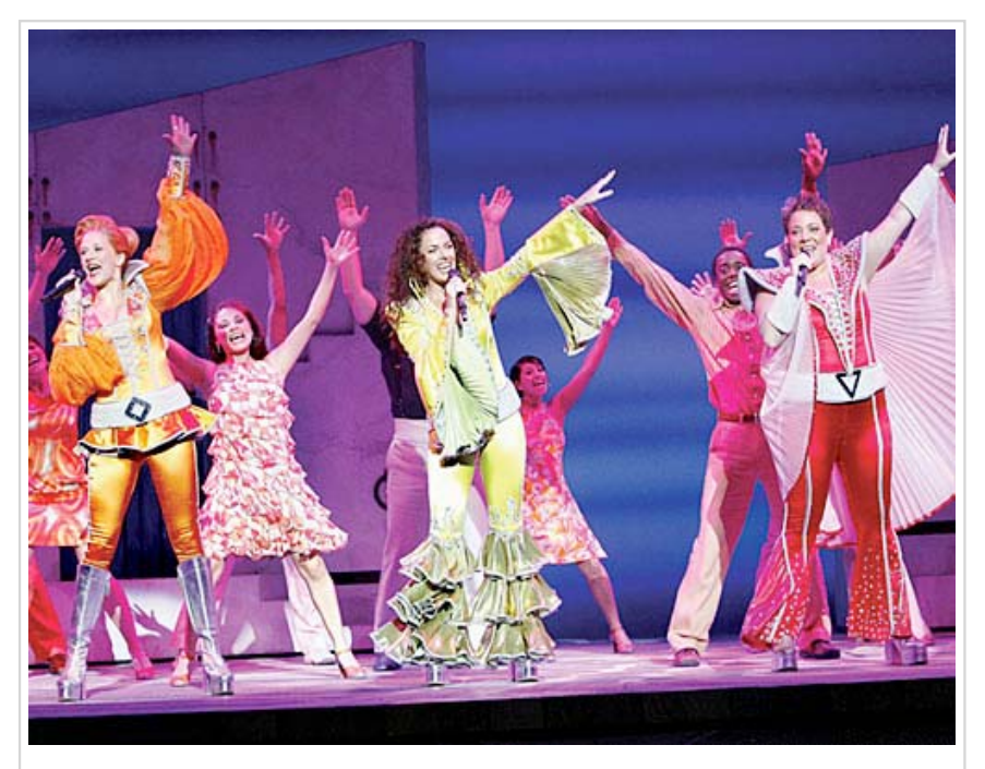
The stage version of Mama\ Mia! is one of the shows coming to Stephens Auditorium during the 2010-11 season.