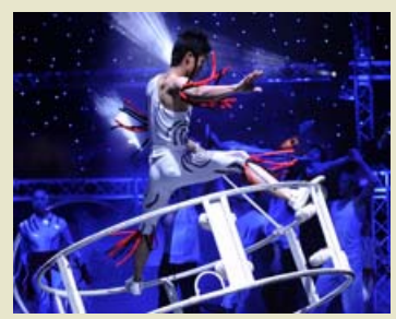
Le Grande Cirque