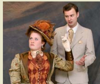
The Importance of Being Earnest