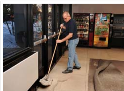
Keeping it clean