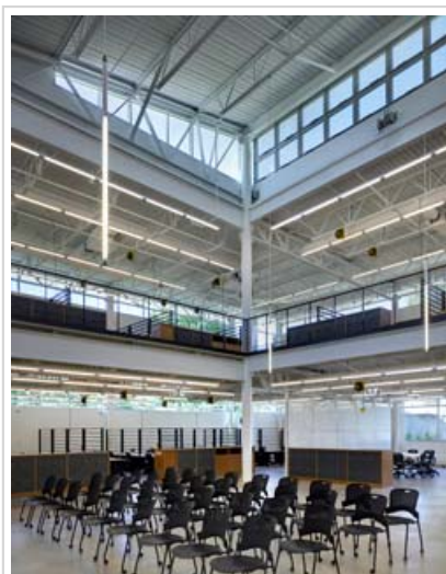
Located on the north side of the College of Design, the $6.6 million, 23,735 gross-square-foot King Pavilion features a central, two-story "forum" surrounded by instructional studios used by all freshmen in the college, as well as sophomores in architecture, landscape architecture and interior design.