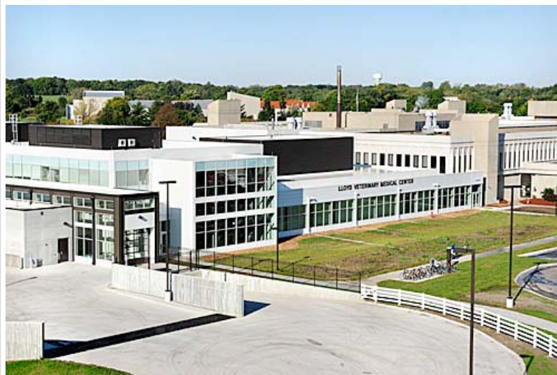
Veterinary Medicine.