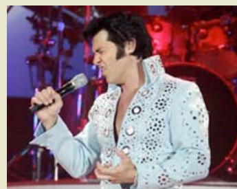
Ultimate Elvis Tribute tour

A series of lectures, concerts and celebrations will honor Martin Luther King Jr. into February.