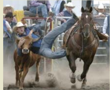
Cyclone Stampede Rodeo