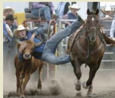
Cyclone Stampede Rodeo