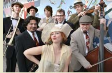
White Ghost Shivers