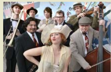
White Ghost Shivers